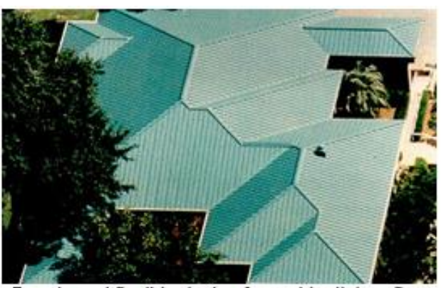
Beauty and flexible design for residential roofing