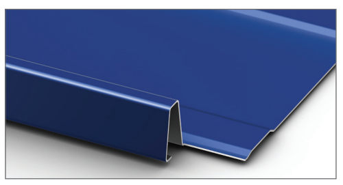
Factory Eave Notch