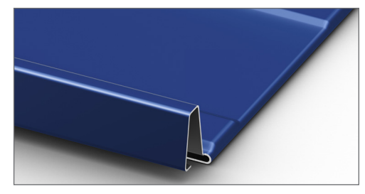
Eave Notch Folded in Field