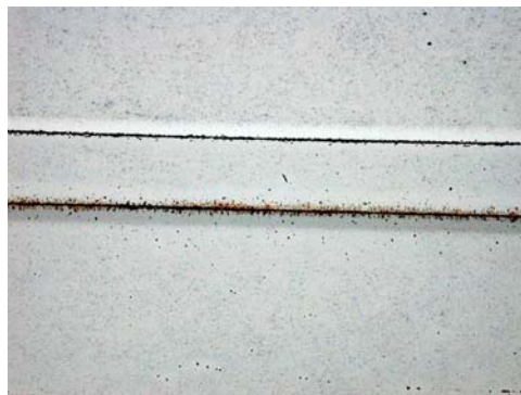
Figure 1. Red rust on tension bends of prepainted HDG.

Hot-dip galvanized steel is coated with zinc, which provides corrosion resistance to the steel substrate. After severe bending or forming, fine cracks may develop in either the paint or the zinc coating on the tension side of the bend. At the initial stage of corrosion, zinc sacrifices itself to protect the underlying steel. White corrosion products might be observed around the fine cracks in the paint on the tension bends since the products of zinc corrosion are white. As the corrosion progresses, the zinc underneath the paint is consumed and the paint flakes off since there is nothing for the paint to adhere to. Red rust may subsequently developed on the underlying steel. This process may take years to initiate depending on the environment, the paint system used, thickness of the zinc coating, and the severity of the strain or radius of the bend involved. Figure 1 shows an example of red rust on the tension bends of a prepainted HDG roofing panel after several years of outdoor exposure.